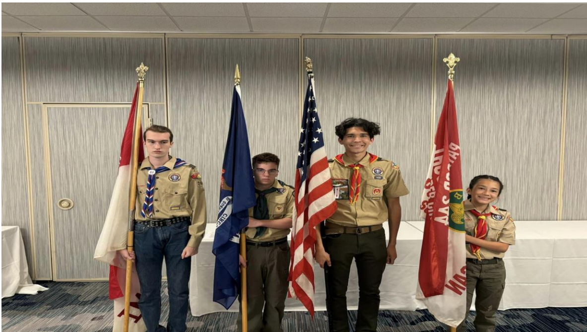
Opening Ceremony with Scouts from Troop 244.