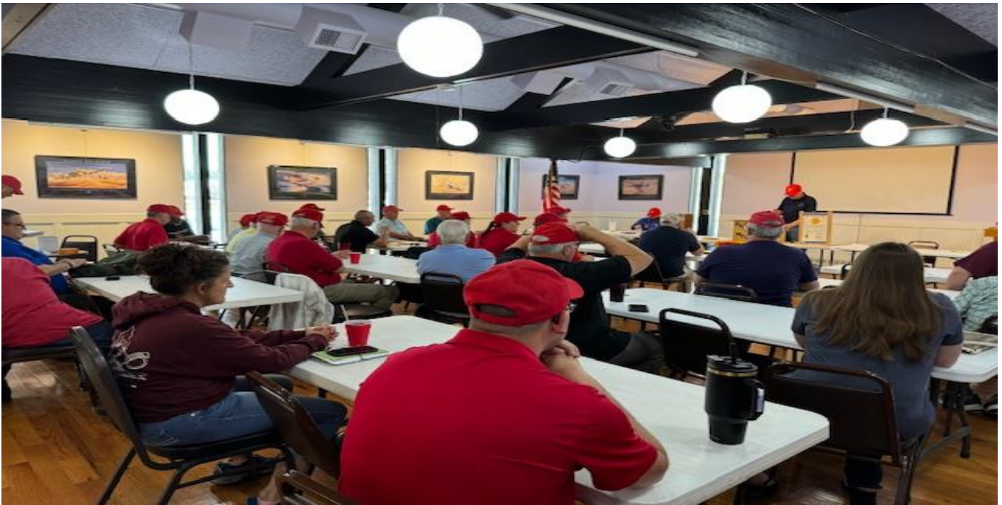
The June MCL meeting was well attended by 33 members and one guest. Attendees received information on upcoming events and detachment activities.