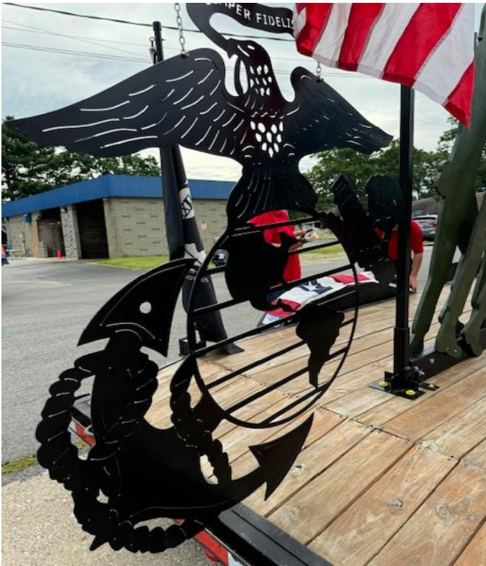
The EGA on the Parade float